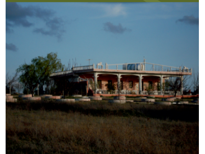
Logeman – Guest house